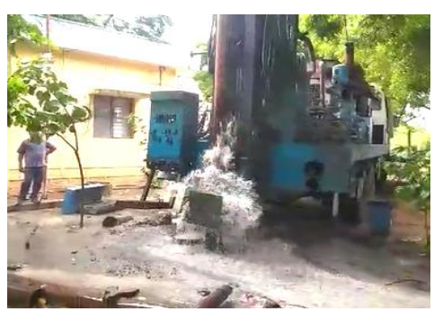
Well drilled by CGWB at Pallamale village in Chimakurthy block of Prakasam district, Andhra Pradesh.

National Aquifer Mapping and Management (NAQUIM) Programme: As a part of the studies carried out during the month of Aug. 2020, CGWB has constructed 13 high discharge wells in the States of Karnataka (1), Telangana (5), Andhra Pradesh (1), Kerala (1), Jharkhand (1), Madhya Pradesh (1) and Jammu & Kashmir (3). The discharges of the wells range from around 270 to 1344 litres per minute (lpm).